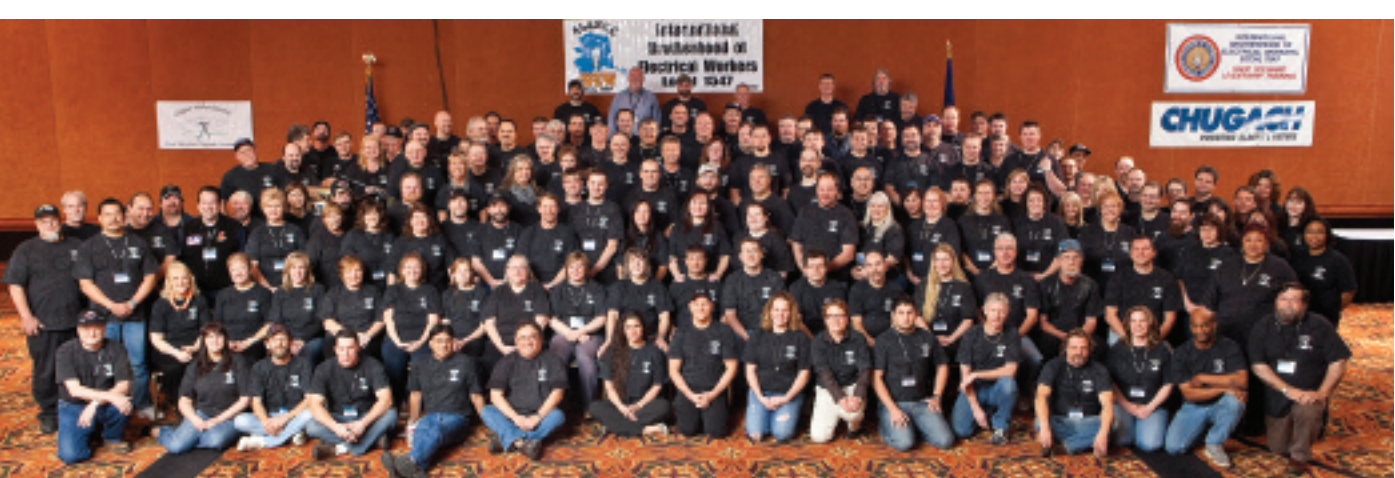
Participants gather for the Local 1547 Shop Steward Leadership Training summit in Anchorage, AK.