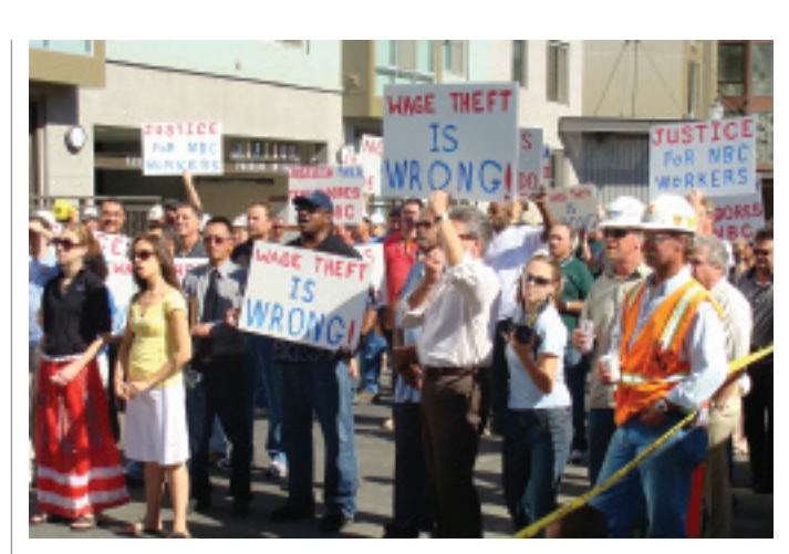
San Francisco labor activists protest a construction contractor found guilty by state officials of cheating workers out of wages and benefits.

"Misclassification is one of the biggest challenges facing the building trades, but I think it's an issue that elected officials across the country are ready to move on," Davis says.