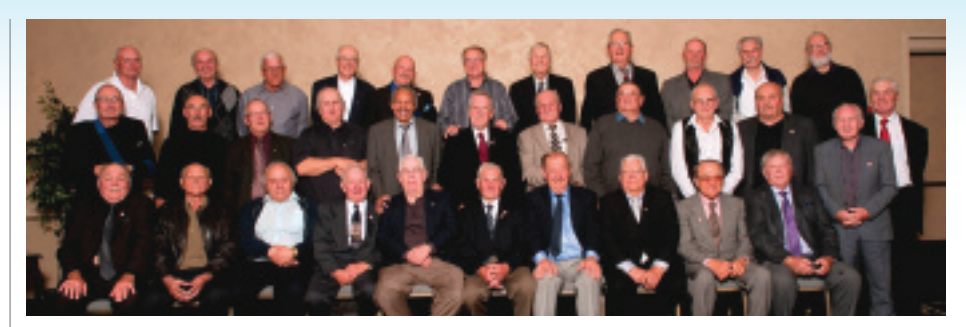
Attending the 50th anniversary banquet of Local 2085, a group of retired members assembles for a photo.

thank-you to all our retirees and wishes them all good health and an enjoyable retirement.